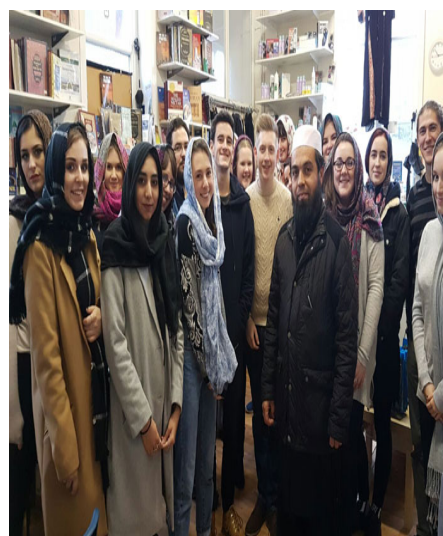
Visit to the Mosque by Winchester University. Islamic Learning and Dawah