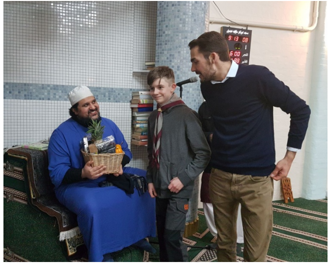
Copythorne Scouts Group Visiting Abu Bakr Masjid