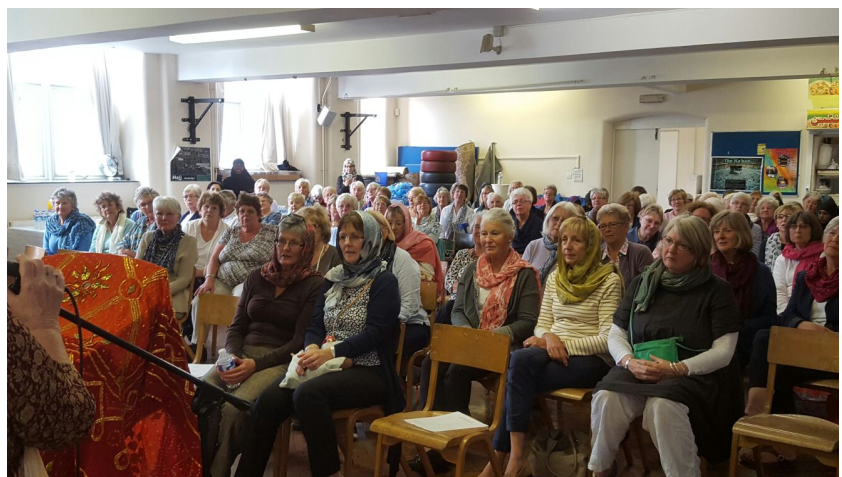
Hampshire Women Delegation Visiting Abu Bakr Masjid and Learning about Islam