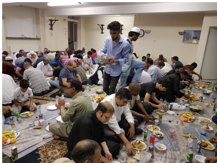
Ramadan Eftar at Abu Bakr Masjid