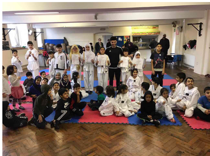
Sports and Social: Youth Centre