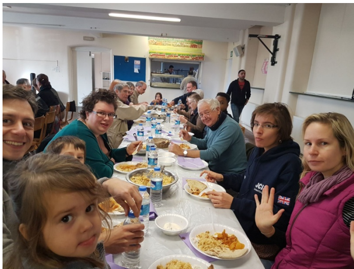
Interfaith Community Dinner at Abu Bakr Masjid