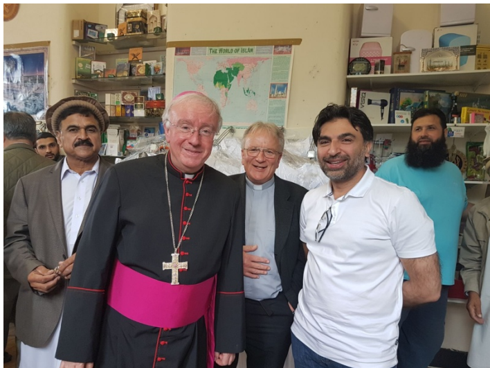
Christian Delegation Visiting Abu Bakr Masjid